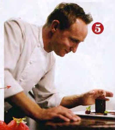
Le Jardin des Sens is attached to a Relais & Chateaux hotel of the same name.

6 Garrigue strawberries are a local point of pride and they're amazing. They're less uniform and tastier than the ones found in North American supermarkets.