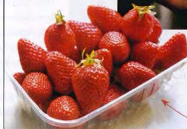
Garrigue strawberries are much brighter red and more fragrant than "normal" strawberries.